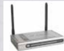
MIMO home router