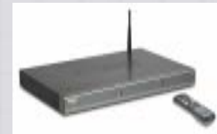
HDTV USB2 Wi-fi