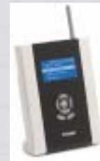
iRadio MP3.WMA.WAV HD add-in USB2 Wi-fi